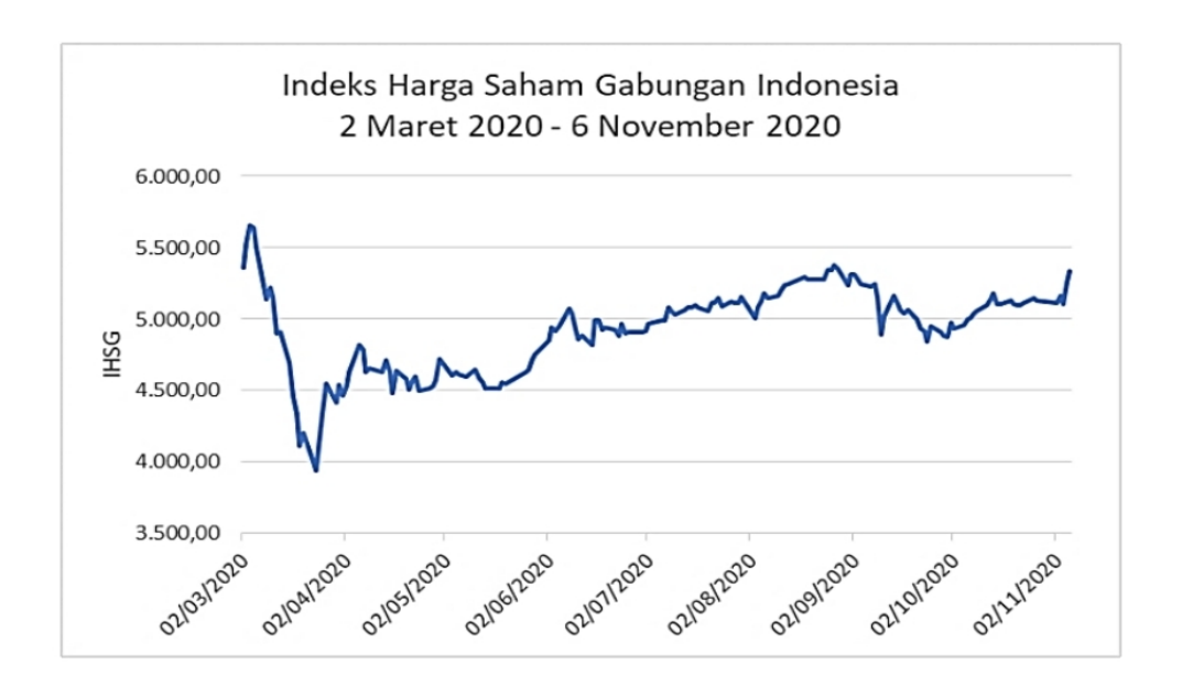
Figure 2. Indonesia Composite Index During the Covid-19 Pandemic (March-November 2020)

In the study conducted by Halisa and Annisa (2020), the analysis of IHSG Indonesia was conducted by identifying many variables, such as the Case of Covid-19, Rupiah Exchange Rate, and Foreign Stock Price Index (IHSA), while this study only focused on the phenomenon of covid-19 cases against the volatility of JCI before and during Covid-19 in Indonesia. The impact of the financial crisis due to the Covid-19 pandemic can be reflected in the volatility of the Indonesia Composite Index (ICI). Indonesia Composite Index (ICI) is a stock price index that is compiled and calculated to produce trends, where the numbers processed in such a way can be used to compare stock prices over time (Jogiyanto, 2013). Here is an image showing the Indonesia Composite Index (ICI) during the Covid-19 pandemic in Indonesia: