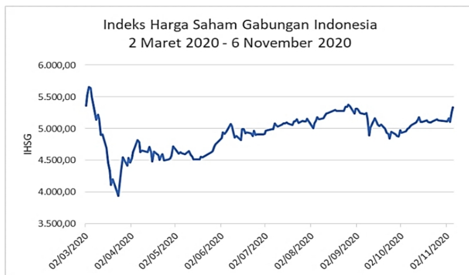
Figure 2. Indonesia Composite Index During the Covid-19 Pandemic (March-November 2020)

In the study conducted by Halisa and Annisa (2020), the analysis of IHSG Indonesia was conducted by identifying many variables, such as the Case of Covid-19, Rupiah Exchange Rate, and Foreign Stock Price Index (IHSA), while this study only focused on the phenomenon of covid-19 cases against the volatility of JCI before and during Covid-19 in Indonesia. The impact of the financial crisis due to the Covid-19 pandemic can be reflected in the volatility of the Indonesia Composite Index (ICI). Indonesia Composite Index (ICI) is a stock price index that is compiled and calculated to produce trends, where the numbers processed in such a way can be used to compare stock prices over time (Jogiyanto, 2013). Here is an image showing the Indonesia Composite Index (ICI) during the Covid-19 pandemic in Indonesia: