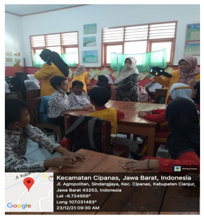
Figure 2. The Sample of Photo the Students Work Collaboratively with their Friends and Teachers