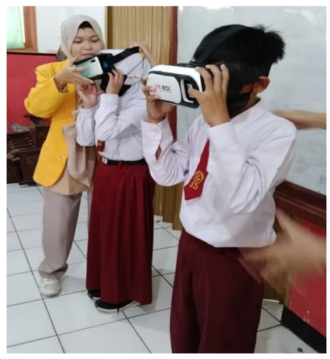
Figure 1. The Sample of Photo of Simulation of Using Technology in the classroom

In every teaching and learning process it should be opened with the initial activities. These activities are carried out by the teacher to create an atmosphere of students' readiness and gathered students' attention to focus on the things to be learned. The activity of opening the lesson is an activity prepare students to enter the core activities (main activities) closing the lesson is activities to solidify or follow up on the topics to be discussed. The component of opening lesson skills consists of attracting students' attention, motivation, giving references through various efforts, and making links or relationships between the materials to be studied. The specific purpose of opening the lesson is the emergence of students' attention and motivation to deal with learning tasks that will be done; students know the limits of the task will be done; students have a clear picture of possible approaches taken in studying parts of the subject matter; students know the relationship between experiences that have been mastered with new things to be learned or unfamiliar; students can relate the facts, skills or concepts listed in an event; and students can find out the level of success in learning the lesson, while the teacher can know the level of success in teaching (Sundari & Muliyawati, 2017).